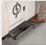
Front step with storage