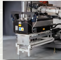
Rolled out Solder pot