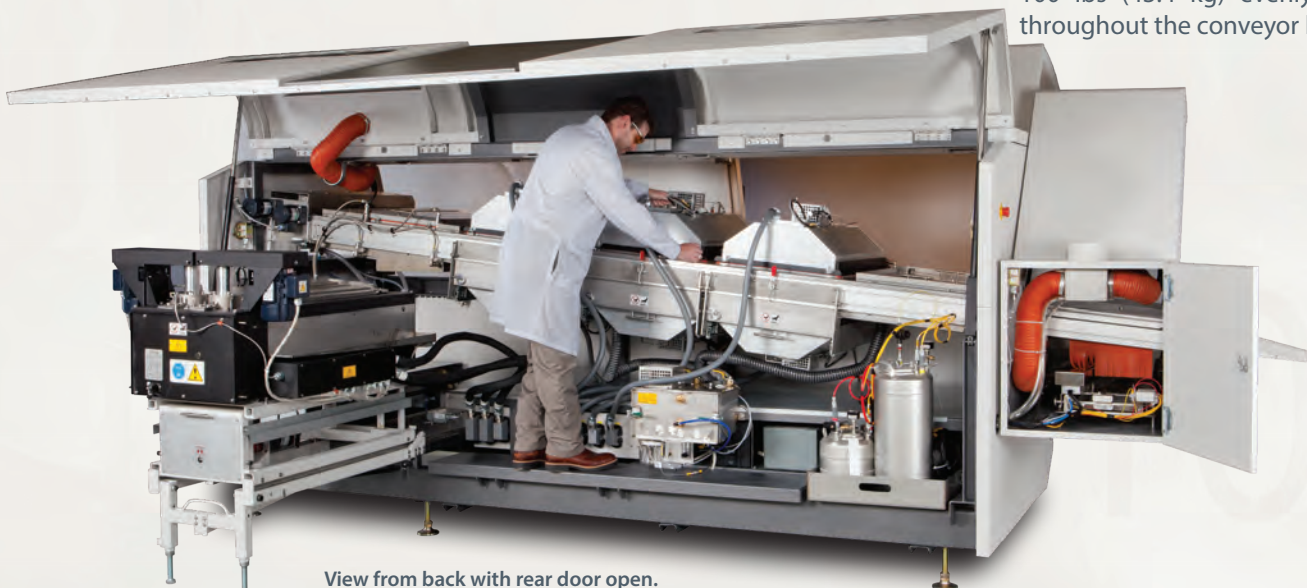
View from back with rear door open.