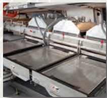
IsoThermal Convection Preheat (ICP)