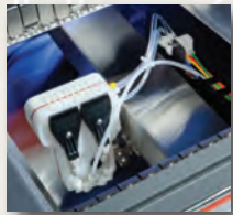
Optional Dual Head ServoJet