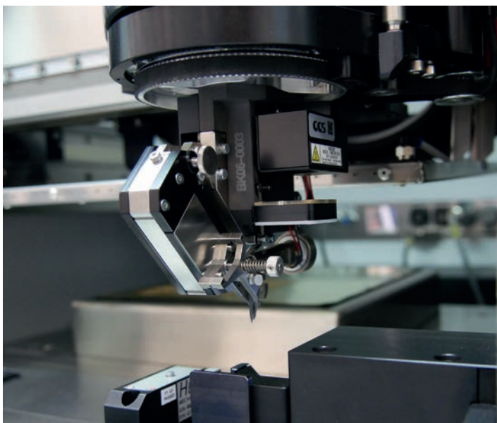
Fine wire bondhead 45°