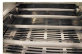
Infrared Heating Tube