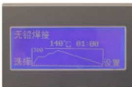
Liquid Crystal Display (LCD)