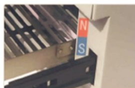
Magnetism Absorb Seal