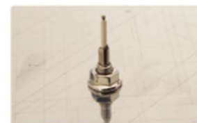
Ceramic Thermoelectric Couple