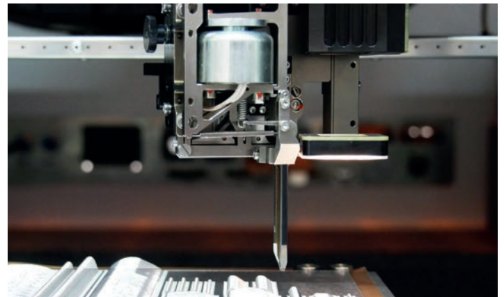
HBK Heavy Wire Bondhead